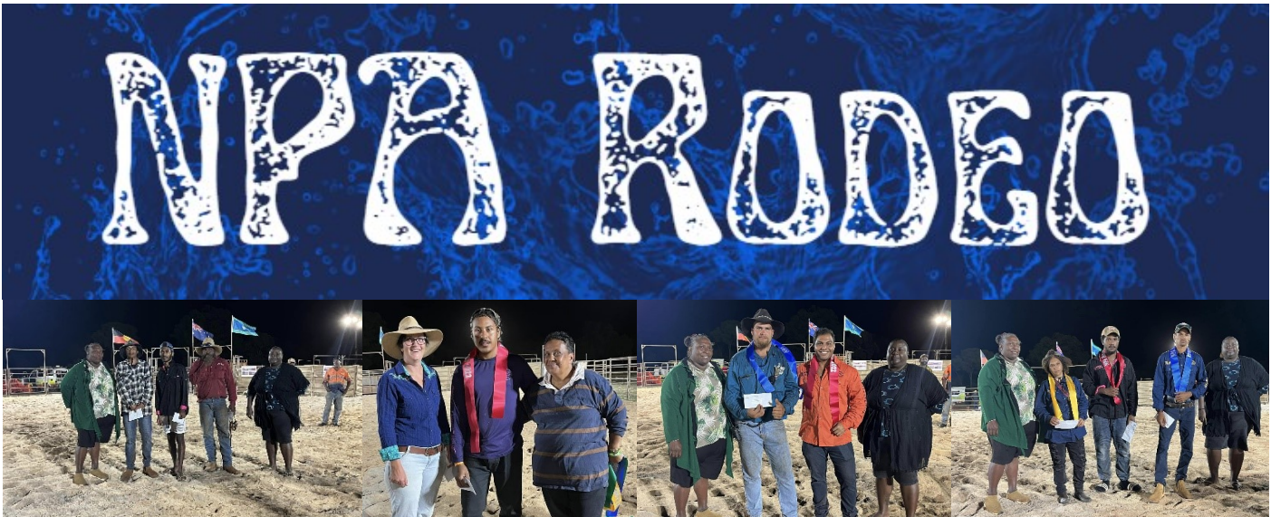
The annual NPA Rodeo is always an exciting time for our region. We had a record number of participants. Congratulations to all the winners for 2022 and thanks to all the sponsors for your support.