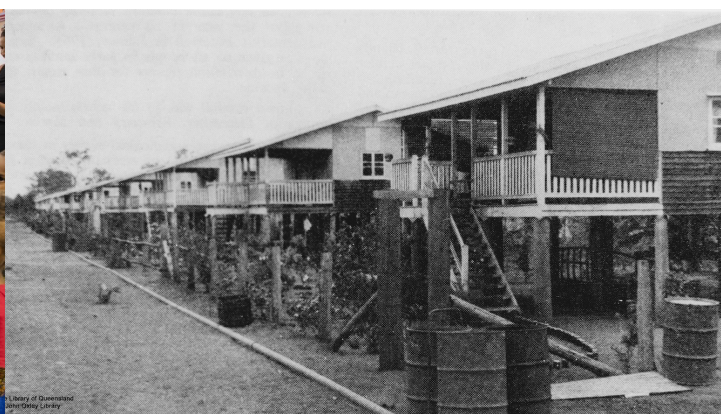
New Mapoon, at Bamaga Settlement, Cape York.